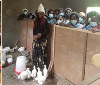
Trainees during practical training in a reference poultry farm. June 2021