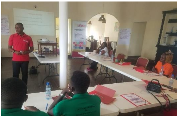
5 AWE-Vibrant Youths participated in the 2-Day workshop