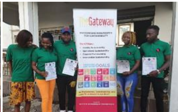
5 Vibrant Youths proudly presenting their certificates