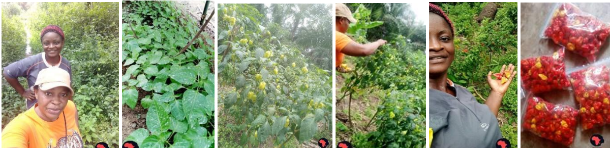
Project coordinators, Tracy and Adeline presenting their product from the nursery phase right till the last phase of packaging and marketing. The Refugee women also engage themselves in other income generating activities such as the pastry (chin -chin production) and Hairdressing