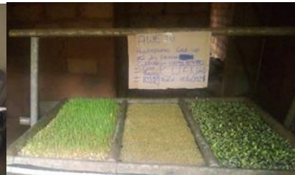
Stage 3: The seeds germinating a few days later. In about 14 days it is harvested and given do pigs as feed. Natural and rich in nutrients