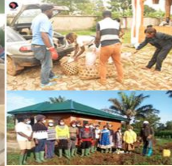
Up: Trainees receiving piglets Down: Trainees receiving lessons on Melon farming