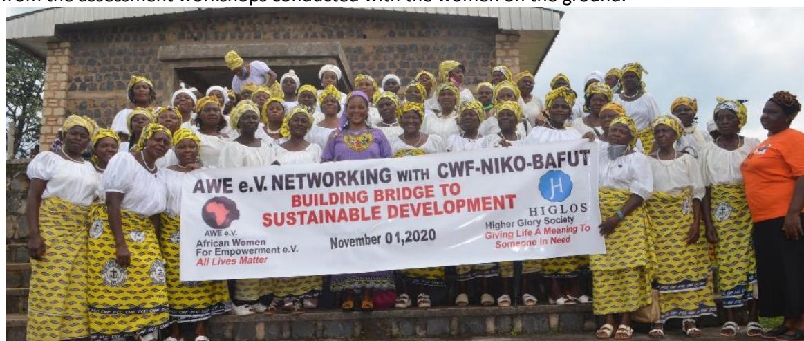
The Christian womens' group in Niko Bafut has eighty members Since October 1 st , 2020, AWE e.V. has developed ideas with these women and carried out several projects. The major aim of networking with grassroot groups is to be able to assess their exact needs, so that we can effectively and jointly carry out project to improve their living standards and to develop their communities

AWE networks with grassroots women's groups. Through our community-based NGO partner HIGLOS, we organized workshops to assess the needs of the women and develop project ideas. Projects such as 'Magot-Azolla-Hydroponic Production' and 'Empowering Women in Bafut' emerged from the assessment workshops conducted with the women on the ground.