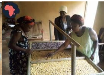
Stage 2: The Trainees putting the seeds in the trays and water them