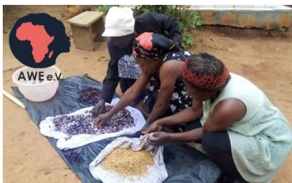
Hydroponic Stage 1: Niko-Bafut women selecting and cleaning the seeds for production

In order to increase agricultural yield in rural communities, AWE e.V. started a project in April 2021 that embarks on training local farmers in Niko, Bafut Northwest Region in Cameroon on sustainable methods to produce affordable feed for their animals and birds. One of such training is hydroponic production which involves the growing of animal feed with very little water and without the use of soil.