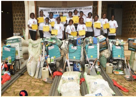
Trainees during graduation ceremony in August 2021. Tools for practical exercise were distributed to them

This project is funded by AWE e.V and the German ministry of cooperation and foreign Aid (BMZ) and implemented by community-based NGO, Higher Glory Society.